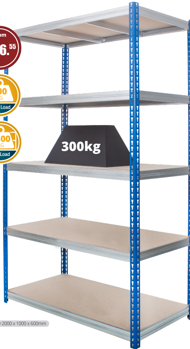
© Kwikrack bay 2000 x 1000 x 600mm