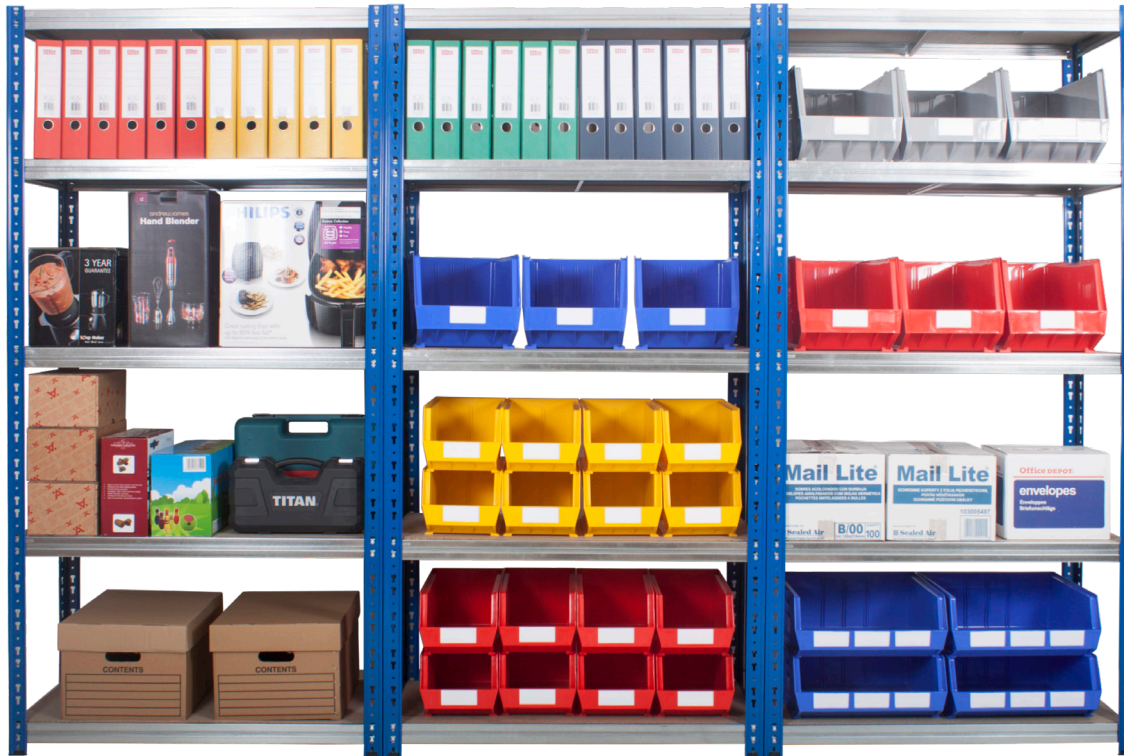
Three bay run of Kwibrack 2000 x 1000 x 450